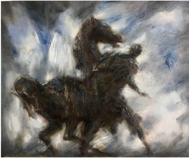
Figure 2. Guo Wenning. Light Cavalry No. 4 . Oil on canvas, 50×60 cm, 2020.

new painting schemas to interpret the present, which is sometimes more like a paradox; only innovations based on inheritance can continue to advance, otherwise, it is like water without origin and trees without roots.