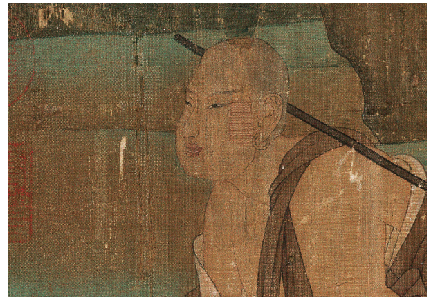
Figure 5. Han Gan, The Painting of the Steeds (excerpt), Tang Dynasty, heavy-color on silk, 27.5×122cm. China, Collection Liaoning Provincial Museum.

likely that the actual foreign monks referred to by the foreign monks in Kanjingsi Cave are from India. In other words, the prototype of Kanjingsi Cave's foreign monk statue is likely to be the Tianzhu monk, also known as Fan monk. And Hu monks rarely enter the upper society; on the contrary, the status and respect of Fan Monks are extremely high.