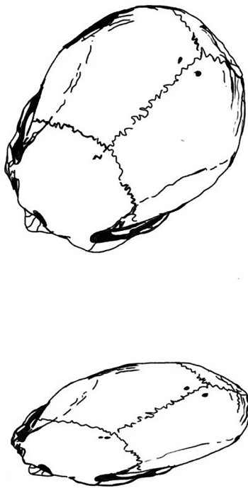
Figure 1. Three-quarters side compression example. From Clay relief .

Generally, the paintings or sculptures of the main Buddha statues in grottoes are positive and solemn, ignoring the bustling crowds around them and staring at the believers who come to worship them. 16 This kind of positive statue contains ingredients for people to worship. When believers bow down or salute the Buddha, they will make eye contact with the Buddha, thus completing the communication between believers