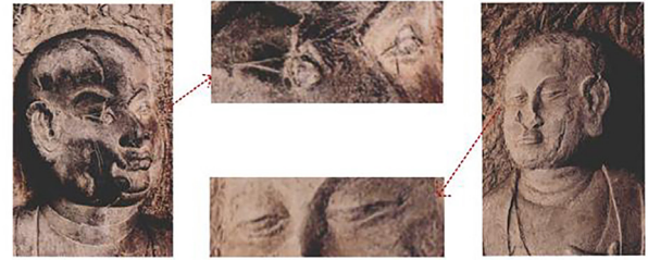
Figure 4. (a) E'nan, four white eyes; (b) Poxiu Pantuo, three white eyes. From Chinese Grottoes · Longmen Grottoes 2 .