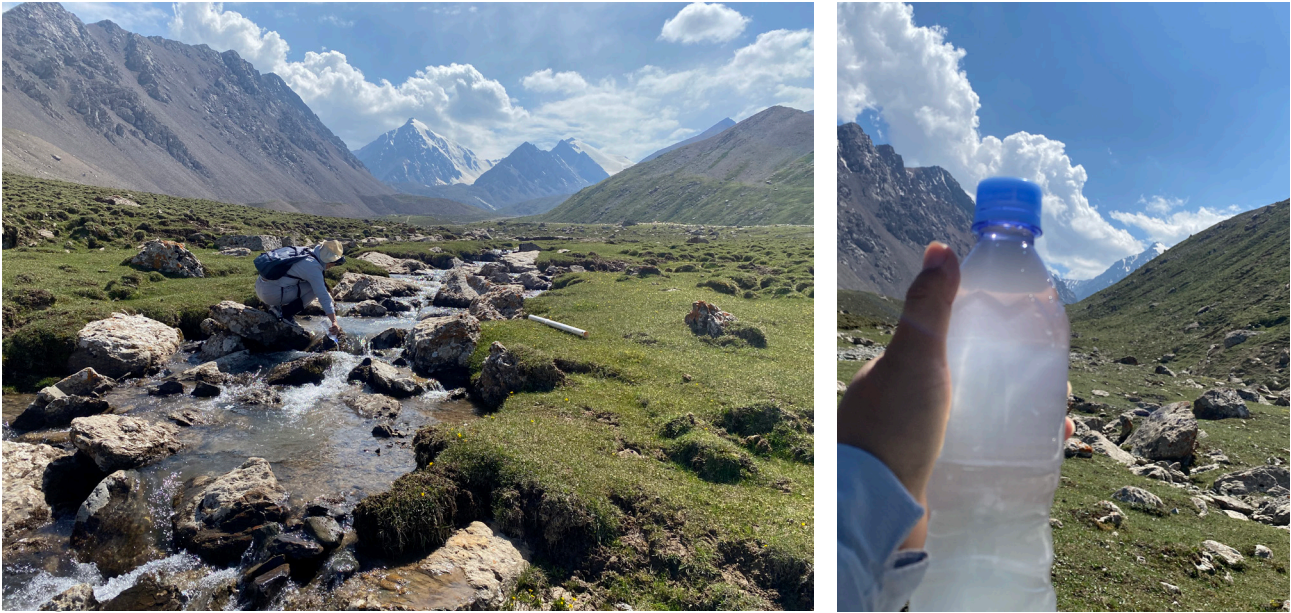
Figures 1, 2. Water sample collection.

symbolic acts suggested how the “ark” might save contemporary art, as well as contemporary people’s lives. Each aspect of the work’s execution contributed to its artistic effectiveness as an event.