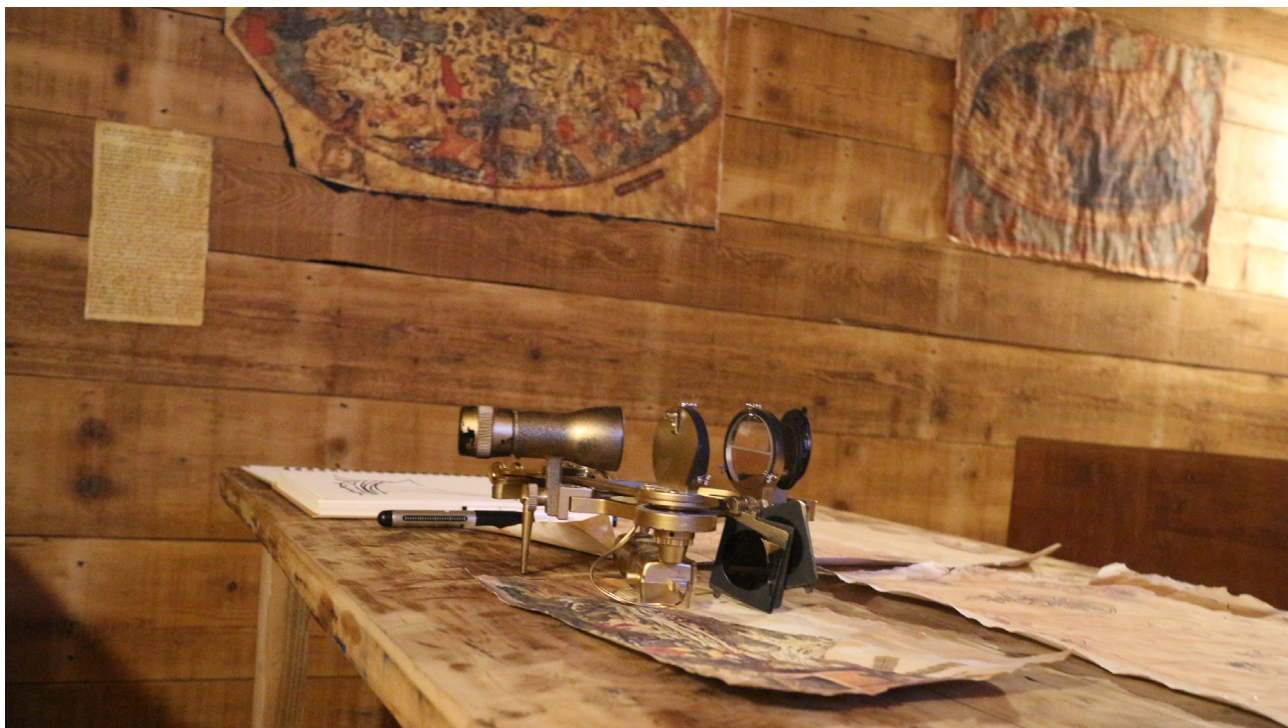
Figures 15, 16. He Gong, The Holy Mother, the Mayflower, Potosi, and the Standard Box . Installation, Variation Size, 2021 .