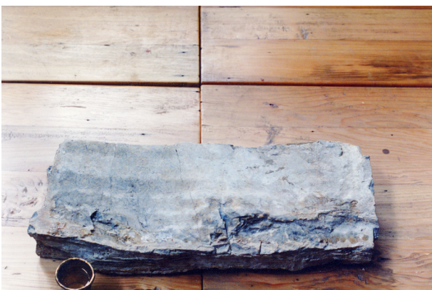
Figures 10, 11, 12, 13. Song Dong. Writing Diary with Water . Performance, 1995 to the present.

transient transformations: qi constantly changes its form. From the point of view of Dao , human beauty and ugliness are relative to their beauty and ugliness. ... Aesthetically, there is no difference between the beautiful and the ugly in terms of their objective qualities; moreover, there is no standard of beauty or ugliness about aesthetic subjects... The Dao is like flowing water: wherever it flows, the difference between beauty and ugliness remains hidden. Water uses selfless love to render ugliness no longer ugly, and beauty no longer beautiful." 13