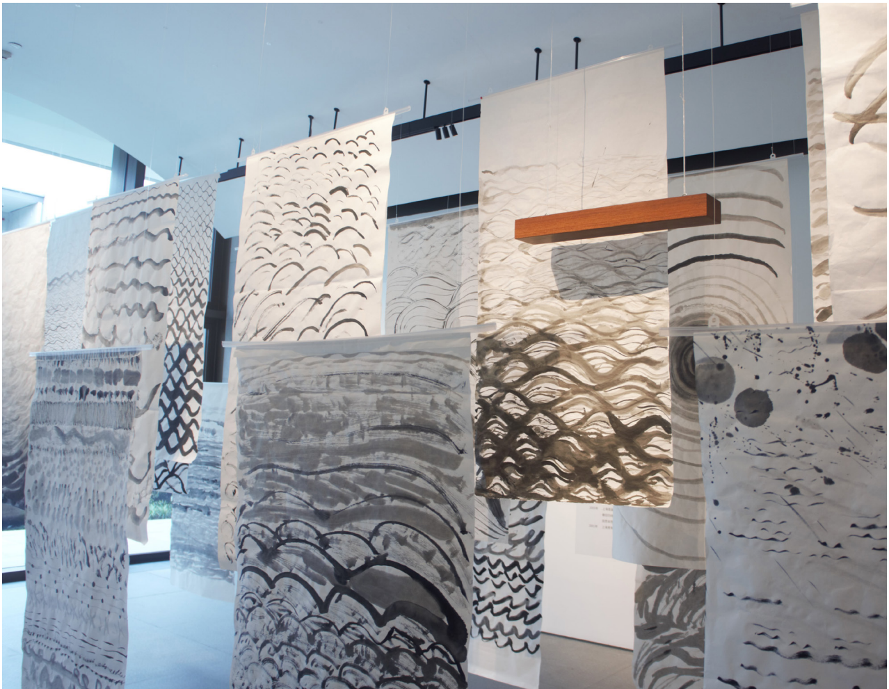
Figures 5, 6. Exhibition Site.