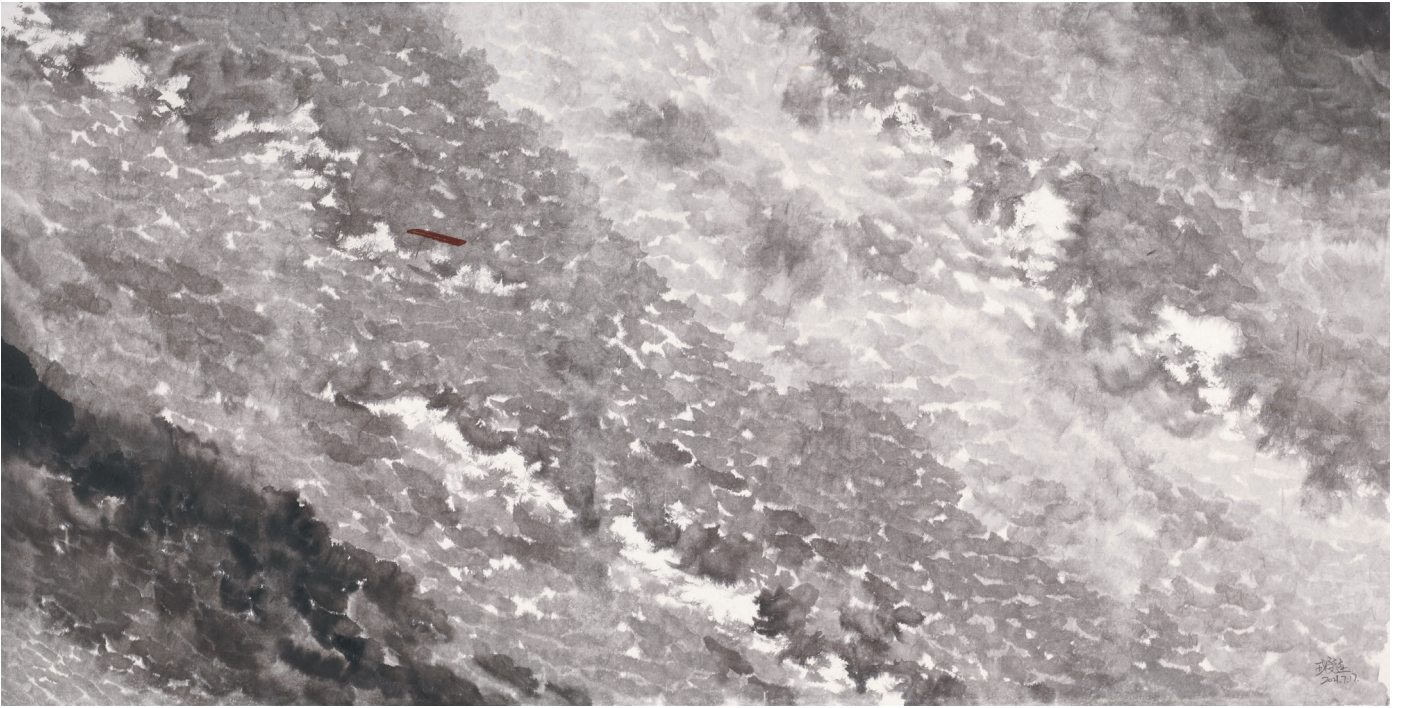
Figure 3. Wang Xieda. The Ark-29 . Ink and wash on Xuan paper, 71×140cm, 2022.