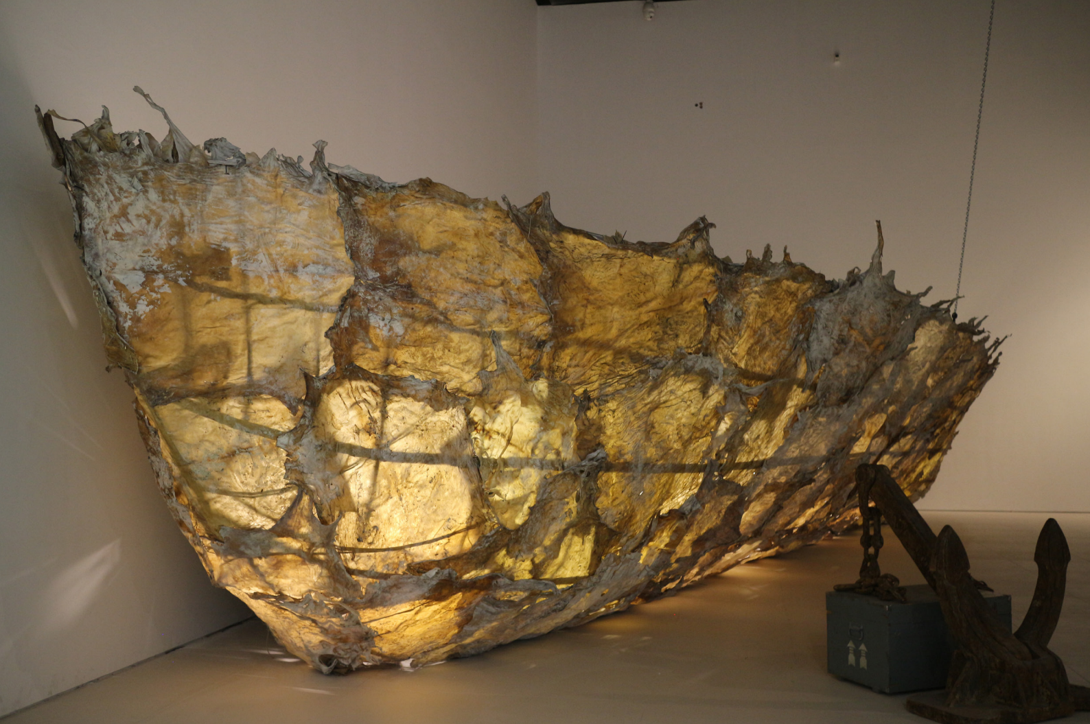
Figure 14. He Gong. The Last Ark . Installation, 280×250×500×1500cm, 2019.