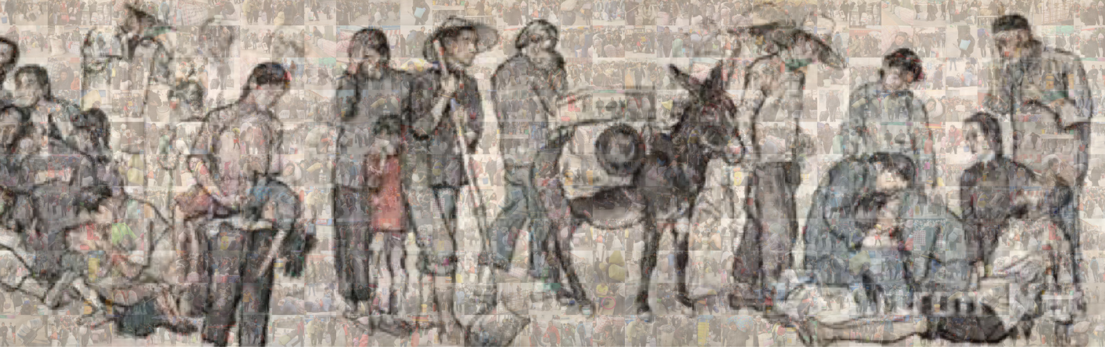
Figure 9. Tami Xiang. Gengzi Refugee Map . Picture, 2020.

cation of standards for standard boxes—do not all these actions represent the human quest for self-redemption? He Gong’s Questioning the Ark of 2012 visualizes transcendent salvation with objective elements such as prayers offered by the Pope.