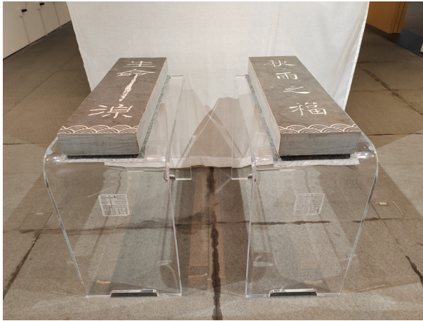
Figure 7. Exhibition Site.

salvation, he was consumed by an intense longing for redemption. Tami Xiang's Gengzi Refugee Map of 2020 (figure 9) visualizes the inevitable difficulties encountered by those on the bottom rung of Chinese society who have abandoned the fight for their salvation and letting others save them, have gone into exile. The 13 th Shanghai Biennale, which convened the same year,