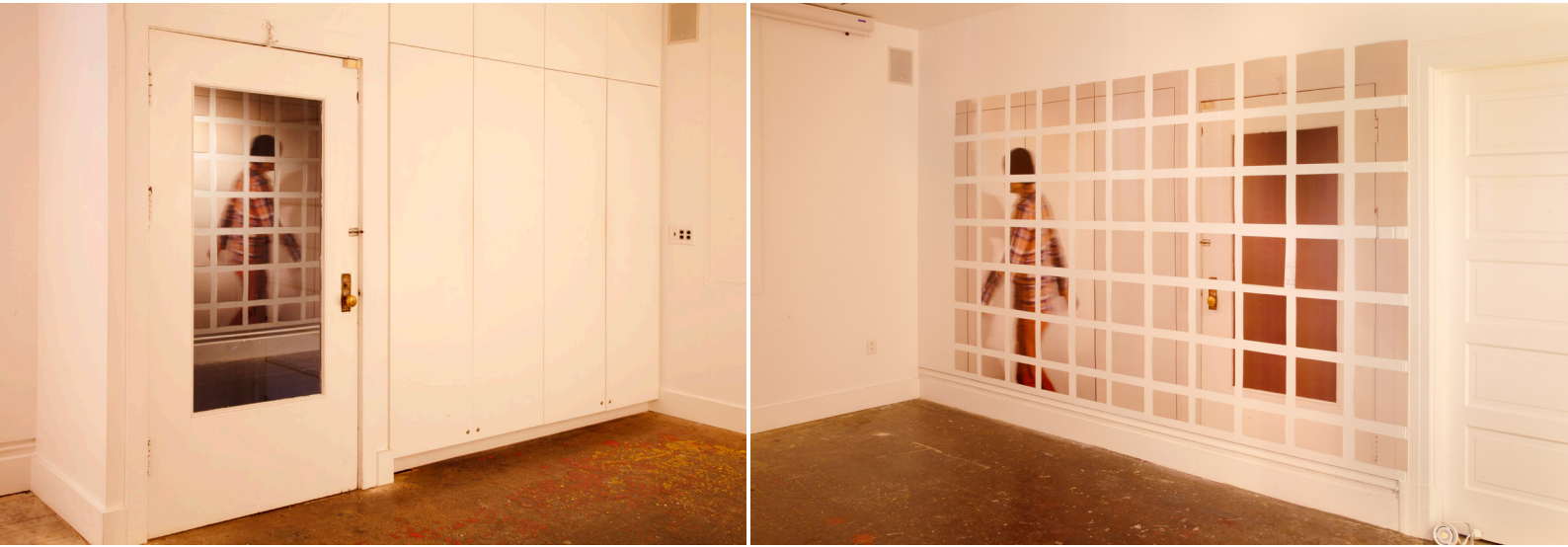
Figure 11,12. Michael Zheng. Mirror Mirror on the Wall . 7 rows×12 columns of photographs each 10"×10", gaps between photographs 2".

to deal with the same things as everybody else. Some of them are quite confrontational. It is my conscious conclusion that none of the prevailing ways has an actual long-term effect on the solution. For example, speaking of political polarization, I used to be very politically involved with the voting process, activism, etc. But over time, I started to see the pros and cons of that way of activism. A lot of it, if we're not aware, actually adds to the confrontational effect in actual life. Of course, politics being what it is, it has to have this confrontational aspect because one is taking a stance. So I value and respect that. And I have friends who make art in that way, and I respect their work. However, I do believe that there is an alternative way of dealing with a confrontational, chaotic, conflict-ridden society, which is to steadfastly go the opposite way. By showing and living it as an example of a possible and plausible way of existence contemporaneously with the other ways, you show them your force.