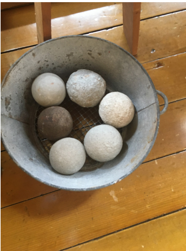
Figure 8. David Ireland. Dumbbells . Concrete cement, circa, 1983.

This is why it's interesting that eventually you come up with a much more figurative interpretation of this relationship through the image of the roots. The tree roots. This very big photographic piece with four images of roots forming a room. ( A ROOT IS NO BRANCH ) That, in terms of language, is also radically different. It's so figurative, so representative, and also spectacular in a way. So, I'm curious to see, you're shifting from a transcendent, almost immaterial kind of fixture of a certain floating moment, a certain fugitive kind of