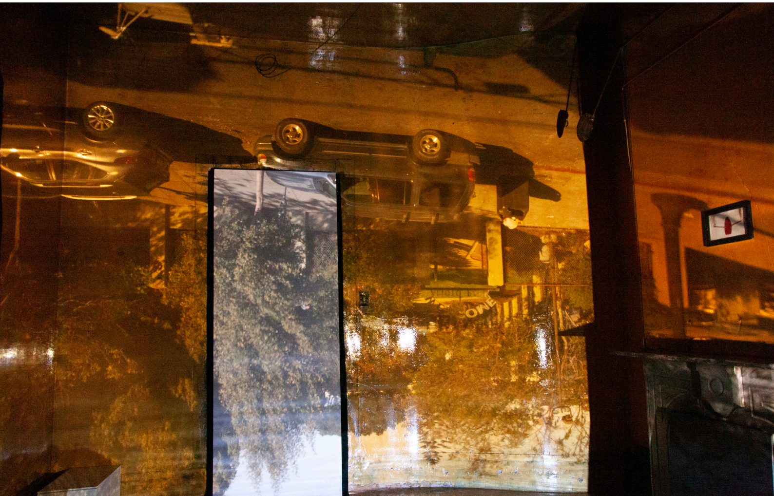
Figure 6. Michael Zheng. As Is (aka Camera Obscura) . Installation, black materials darken the room with only a small hole with a lens in a window.

this artist was given this very authoritative definition of what a chair should be. It's like "Ex Cathedra", from the Pope's chair. What I tried to do was to honor the very last mile of this authoritative definition of a chair, which is the receiver. Once he receives this information, what does he do with it? All the information that he got, the definition and the actual image, was one-directional. And he had to create the other dimensions, like sideways and back ways, the whole three-dimensional aspects of the conceptual chair. He had to make it up. So when you see the chair he created as a result, it's really weird. When you look at it frontally, it looks exactly like in Kosuth's photograph. But from the side, it looks wrong. No matter how you look at it, it's just like, something is off. But for me, the fact that something is off really speaks to my viewpoint on these things. Everybody is doing a re-creation when they are handed certain visual or textual information. For me, that's true with not just Kosuth's piece, but really with any works. I don't know how many times I've sat in front of the Mark Rothko painting in SFMOMA, and every single time I was transfixed; until one time, I didn't feel anything. I was like, what happened? It was the same painting, but I was different that day. And I didn't get anything out of