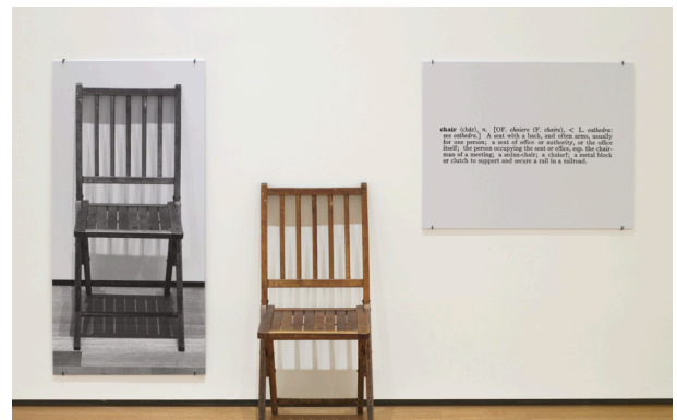
Figure 5. Joseph Kosuth. One and Three Chairs . Courtesy of the artist and Sean Kelly Gallery, New York, image source from The Museum of Modern Art, 1965.

I am just very curious about the Camera Obscura piece, which is another example that emphasizes even more on the flow of time: the flow of things, the flow of images, shadow, air, and also human sounds, and so on. And it's extremely interesting to see the confrontation