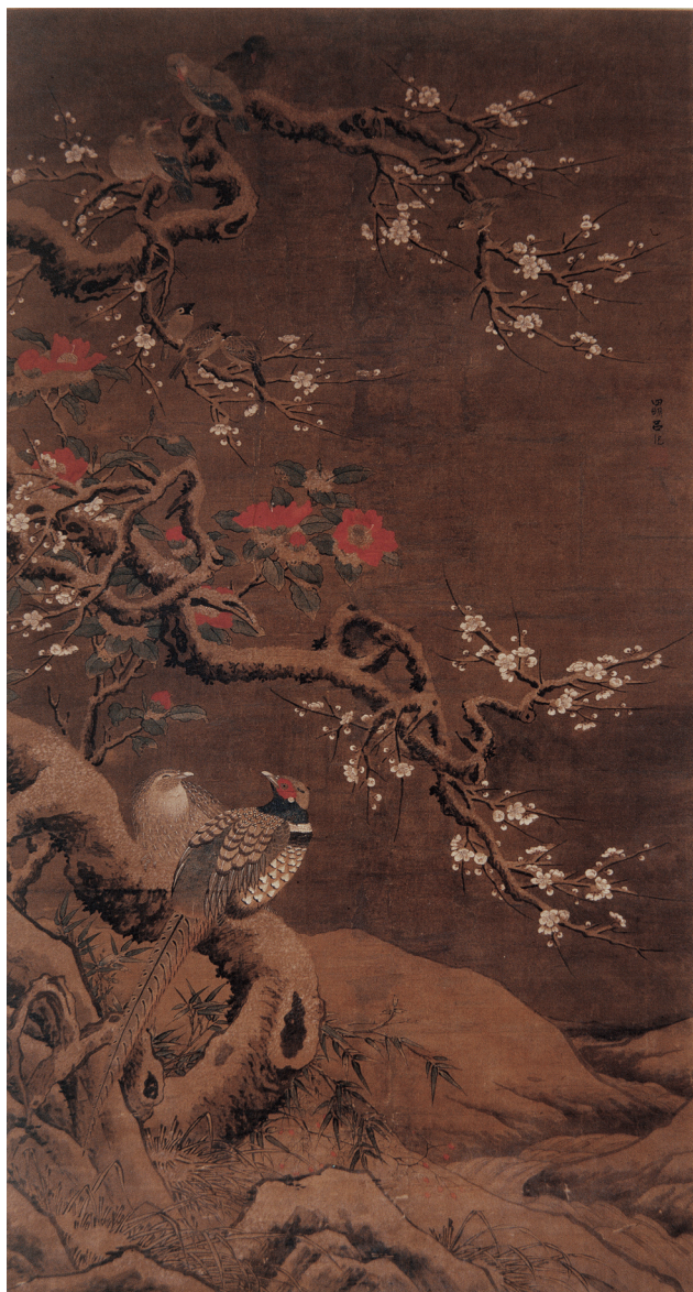
Figure 3. Lü Ji. Mountain Birds amid Plums and Bamboos . Color on silk, 183×97.8cm. China, Ming dynasty, Zhejiang Provincial Museum, Zhejiang, China.