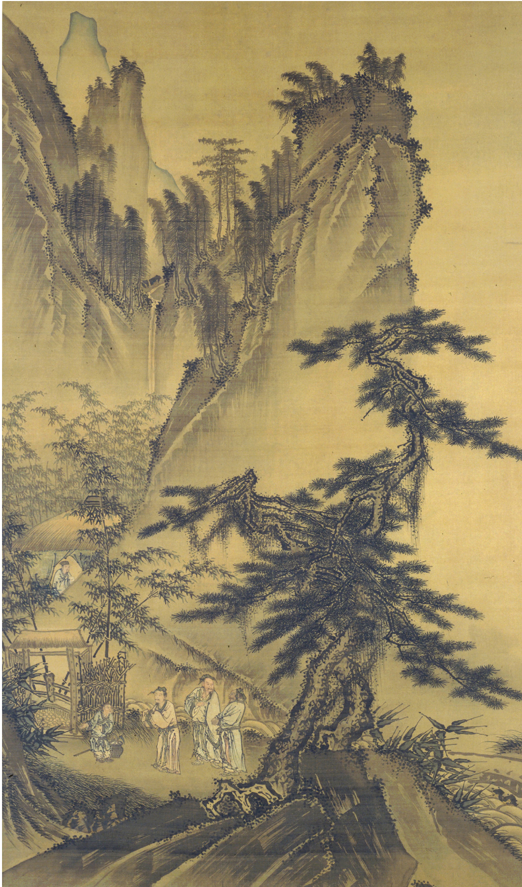
Figure 1. Dai Jin. Sangu Maolu . Color on silk, 172.2×107cm. China, Ming dynasty. Palace Museum, Beijing, China.