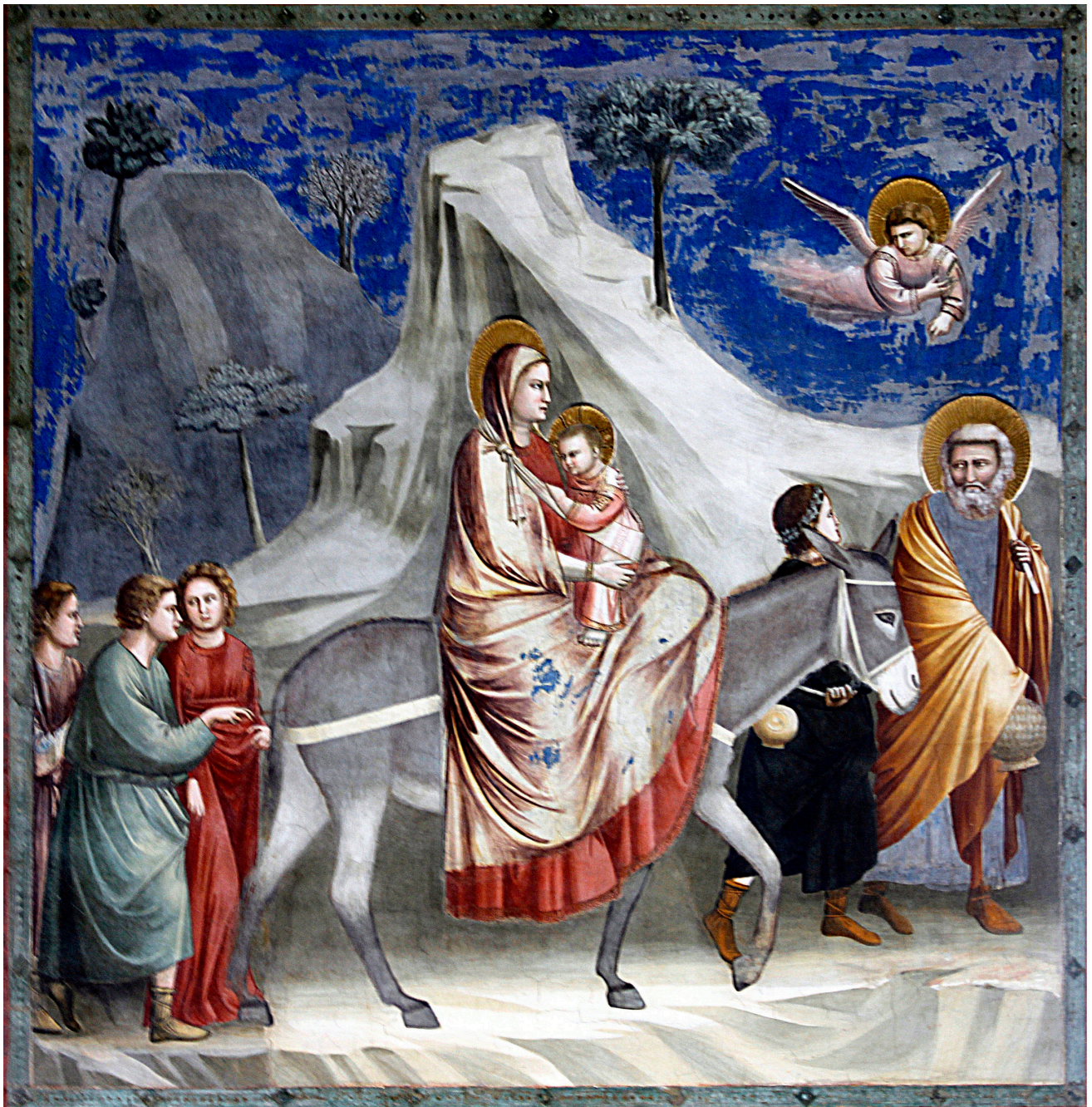
Figure 5. Giotto Di Bondone. Flight into Egypt . Fresco, C. 1303-05. Scrovegni Chapel, Padua, Italy.

precisely. For example, for Giotto Di Bondone, one of the pioneers of the Renaissance, the characters are strong and sturdy in his painting Flight into Egypt , which replaced the soft and gloomy images of medieval characters. It must be said that the spirit of the characters in his paintings is attributed to the rich temperament of ancient Roman sculpture. Still, the spatial hierarchy of its visuals also indicates its differences from previous generations of painting works. For example, when Titian (Tiziano Vecellio) created The Goddess in 1516, he shaped it into