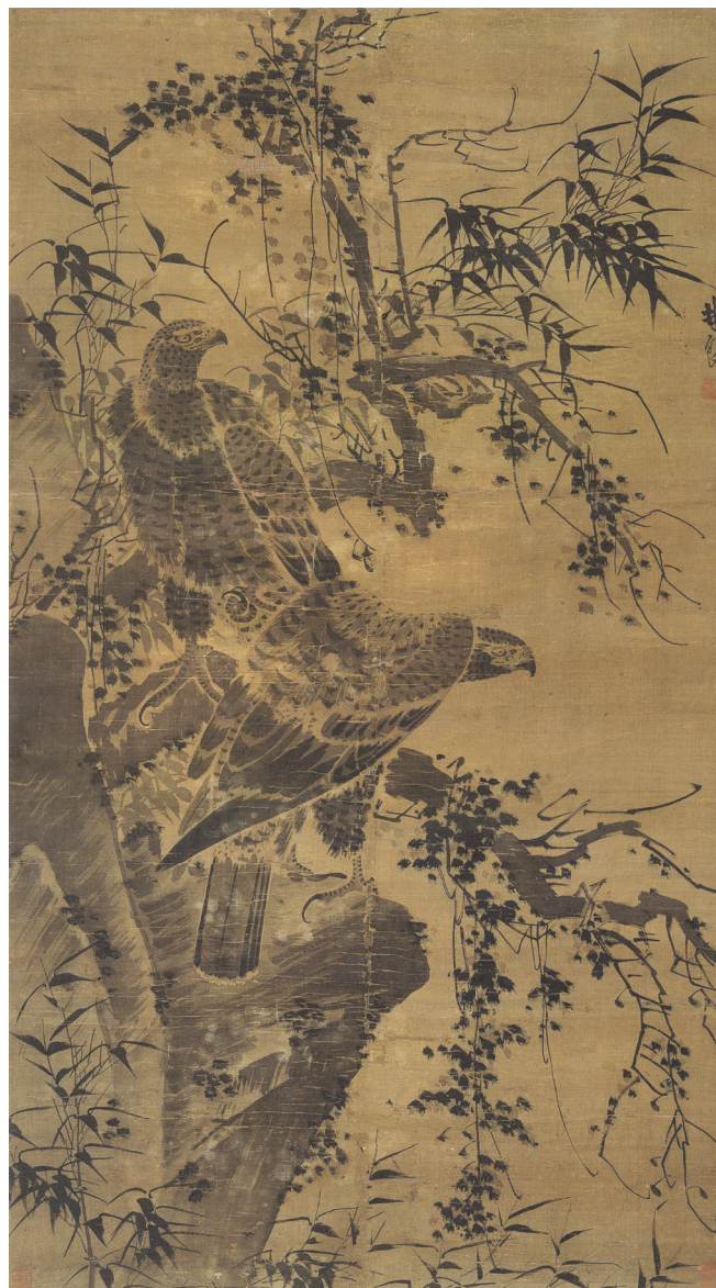
Figure 4. Lin Liang. Two Eagles . Ink on silk, 129.4×75.9cm. China, Ming dynasty, Zhejiang Provincial Museum, Zhejiang, China.

which can be regarded as an excellent example of scientific retro.